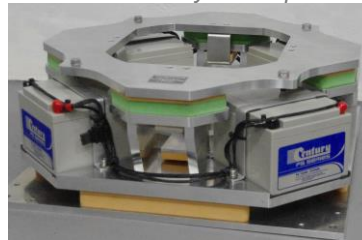
TEG Shock-Mount with battery back-up